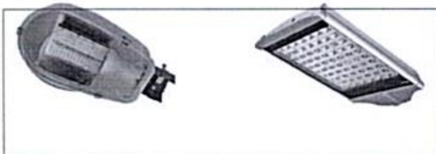
Figure 3: Examples of LED solar street lamp

A 93W LED lamp is a light-emitting diode (LED) product that is assembled into a lamp (or light bulb) for use in lighting fixtures. LED lamps have a lifespan and electrical efficiency that is several times better than incandescent lamps, and significantly better than most fluorescent lamps, with LED able to emit more than 100 lumens per watt. LED are the perfect combinations with solar power as it operates under low voltage, low heat and low power requirement.