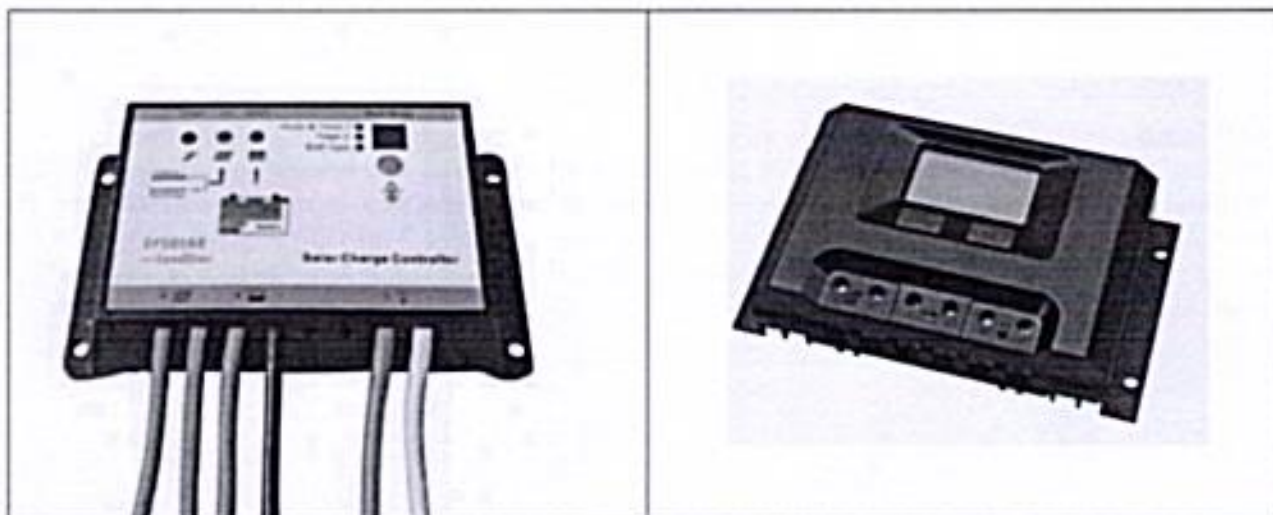
Figure 4: Examples of charge controller

Charge controllers equipped with twilight switches and light intensity dimmer of 15A/24V are used to control the charging of the batteries. Since the output from solar panels are variable and needs adjustments, charge controllers fetches the variable voltage/current from solar panels, condition it to suit the safety of the batteries. The main functions of charge controllers are to prevent over-charging of batteries from solar panels, over-discharging of batteries to the load and to control the functionalities of the load.